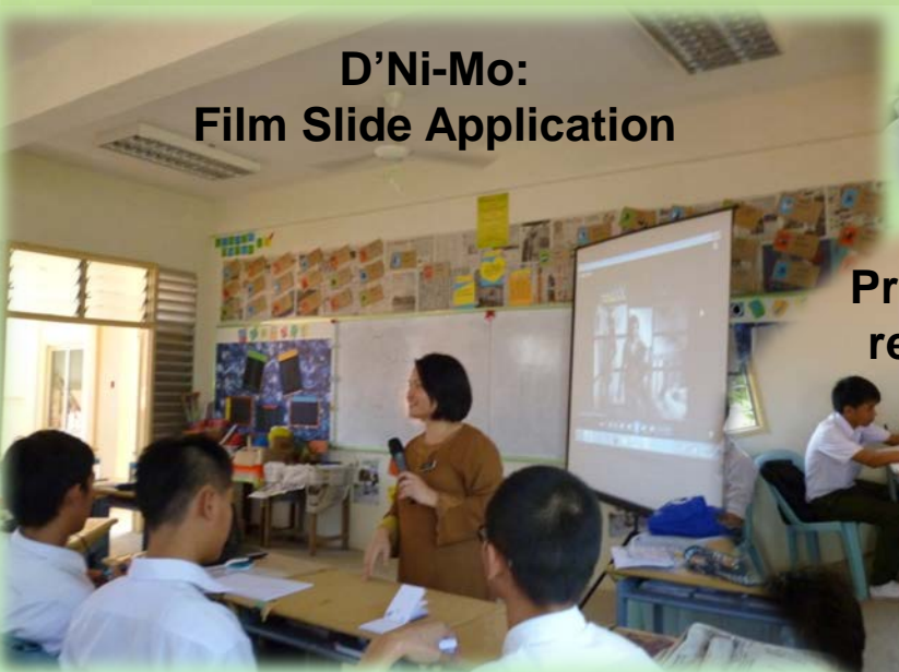
D'Ni-Mo: Film Slide Application