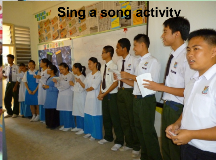
Sing a song activity