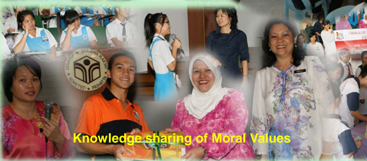
Knowledge sharing of Moral Values