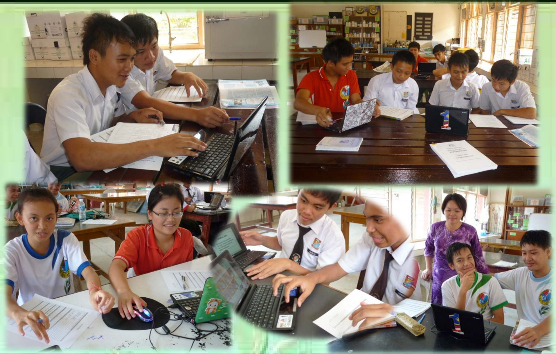
Peer Teaching using D'Ni-Mo