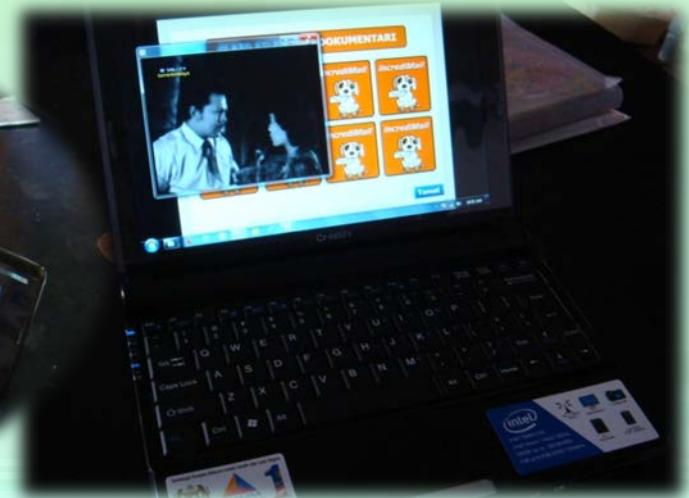
Film Slide in D'Ni-Mo