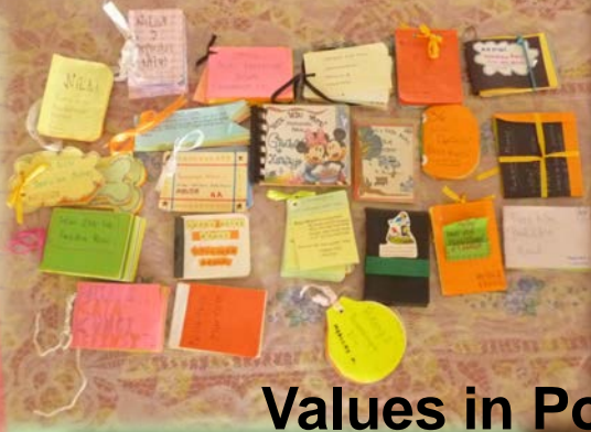
Values in Pocket